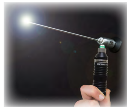
Rigid Endoscope with Portable Light Source sold separately