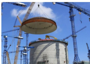
dome of nuclear power station