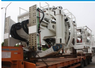
inspection of high altitude large equipment